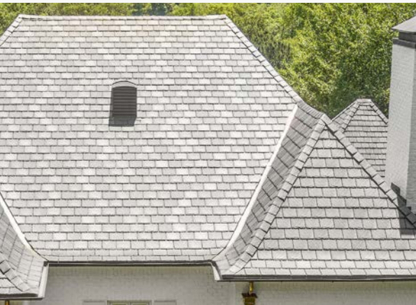
Niagara Slate in Stormy Gray Blend