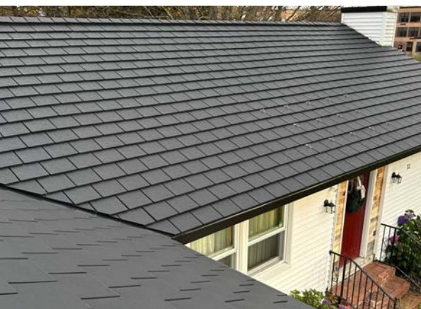
Concrete Flat Tile in Black