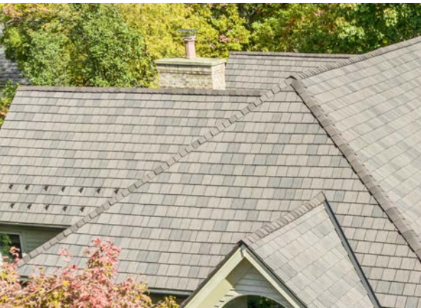
Niagara Shake in Custom Blend