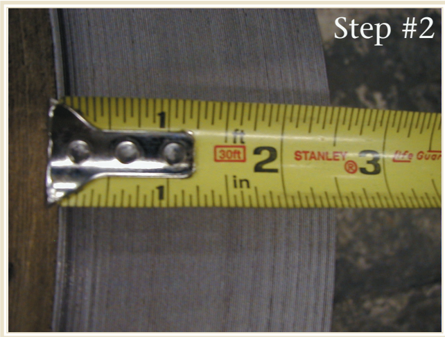
Measure the material's thickness on one side of the coil.

I hope these charts will help you determine how much material is left over from past projects. By taking the time to measure and calculate the amount of material remaining, you will no longer look at an assortment of coils and ask yourself, "What should I do with them?" Who knows, you may be surprised how much material is there and turn your leftovers into cash.