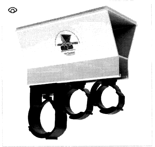
Type of Element Photo