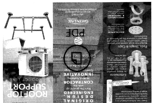
Type of Element Spec Sheet/Brochure

Green Link 3 Panel Brochu... (3.6 MiB) download ↓