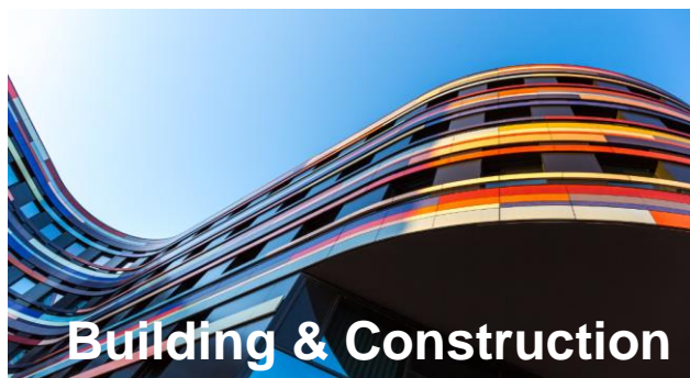
Building & Construction