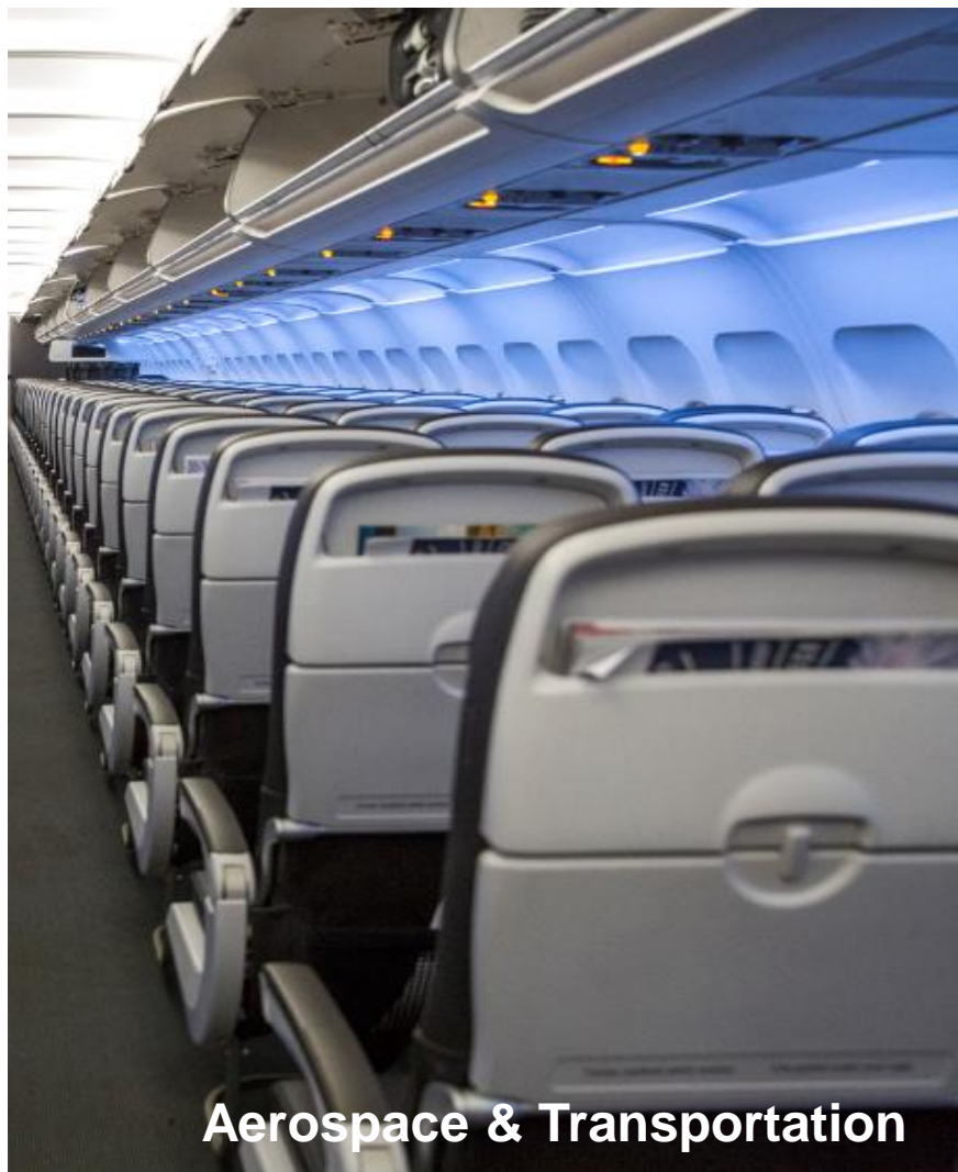
Aerospace & Transportation

Proven applications, globally, for over 50 years