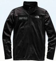
North Face Jacket