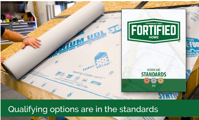
Qualifying options are in the standards