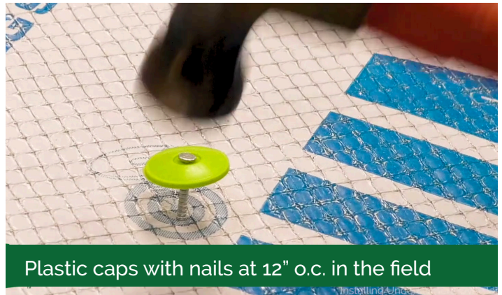
Plastic caps with nails at 12" o.c. in the field