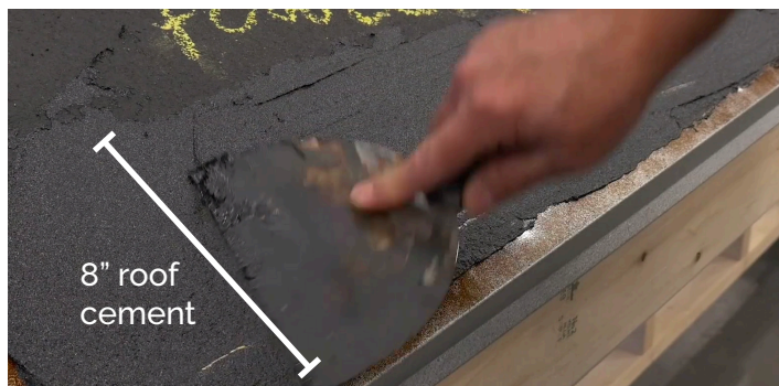
Place 8" (no thicker the 1/8") of roof cement