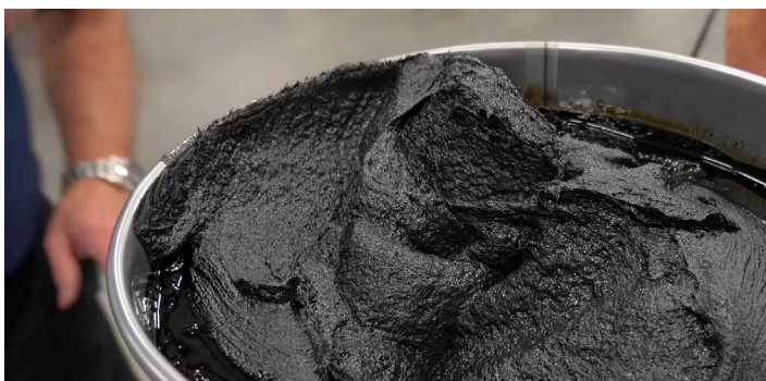
Starter manufacturer approved roof cement