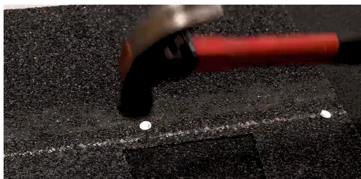
Install shingles using manufacturer instructions