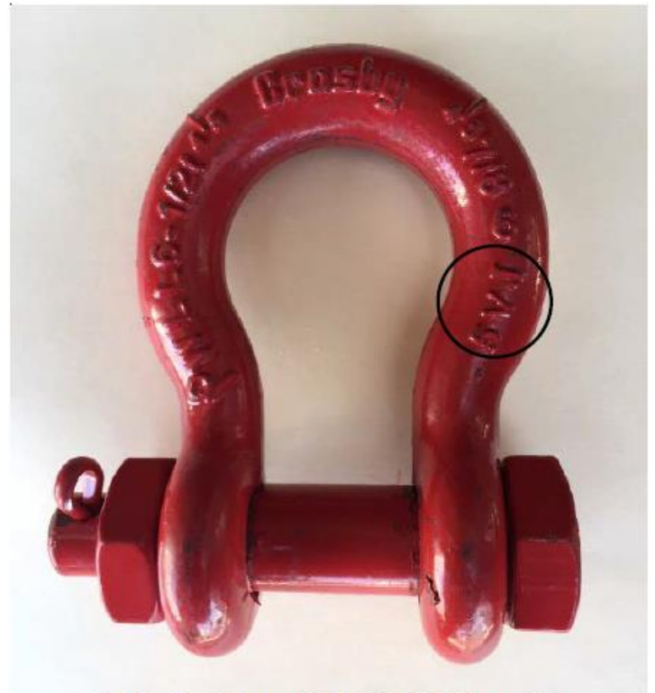
Production Information Code (PIC) Location

Specifically, the 7/8" 6.5t shackles with PIC 5VJ shown on the bow may have this condition. See below image showing the position of the PIC on the bow.