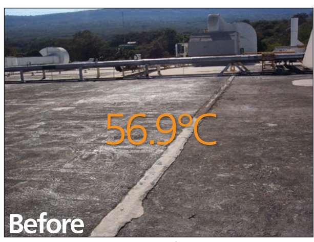
USDA - Mexican Ministry of Agriculture, Mexico

The best part about Topps Seal® may be what it can do for your roof in terms of maintenance savings. The second best may be what it means inside for years to come.