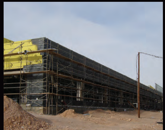
SubSeal offers high strength, high elongation and is flexible to accommodate expansion and contraction of the substrates.