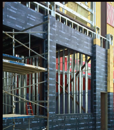
SubSeal is ideal as a through-wall flashing under siding, or exterior plaster and masonry where high moisture content is present.