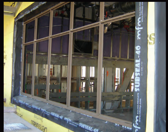
SubSeal bonds aggressively to poured concrete and other building materials. It is fully adhered to the substrate to eliminate movement of water under the membrane.