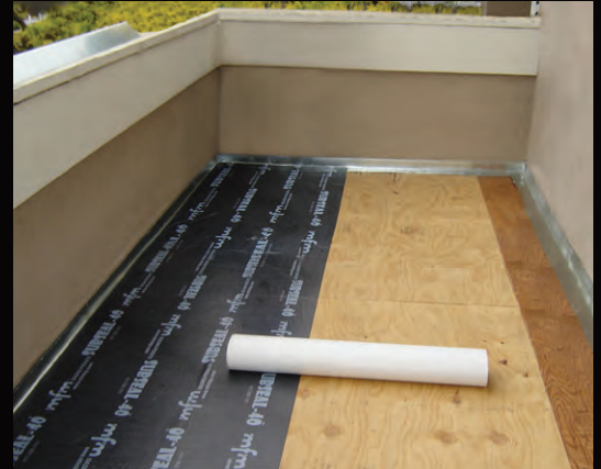
SubSeal is an excellent choice for waterproofing balcony decks and other surfaces that will be finished with concrete or tile.

Call one of our professionals today at 800-882-7663 to get your project on the right track.